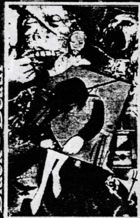
"Wretched People In The Real World"